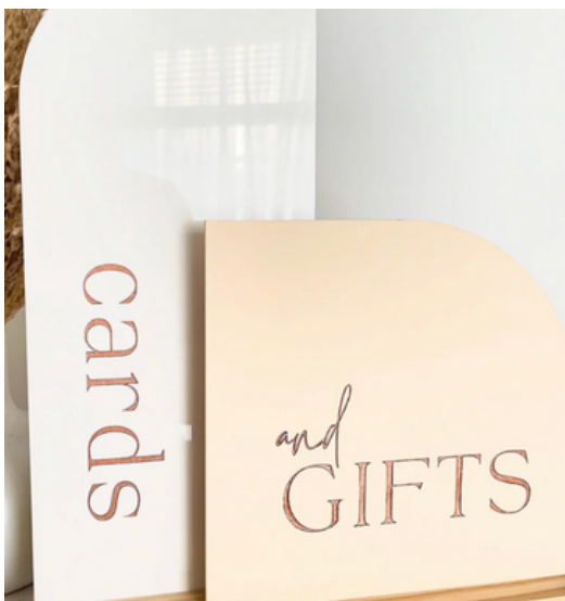
CARDS + GIFTS SIGN