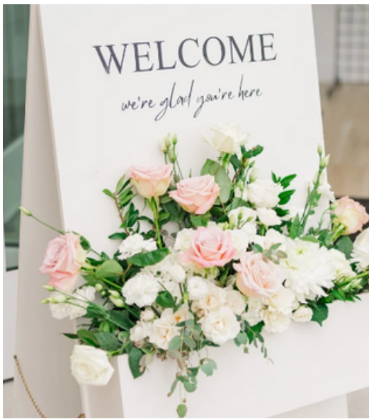
FLOWER BOX WELCOME SIGN